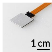
gSKIN ® -XP