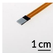
gSKIN ® -XM